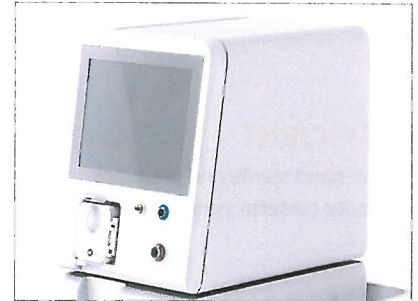
High performance in compact design