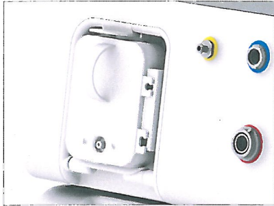
One-hand cassette system