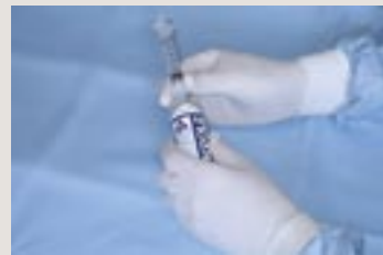
Have a PS Kit ready and connect it