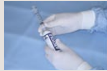
Push while rotating