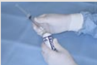
Disconnect, using a left