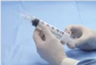
Only keep the required volume.