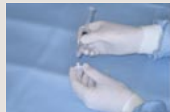
Remove the filter and fit the needle, keeping the cap on until the injection.