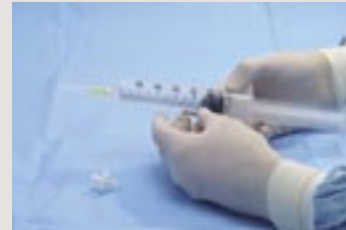
Remove the filter and fit the needle, keeping the cap on until the injection.