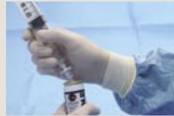
Disconnect, using a right-left movement.